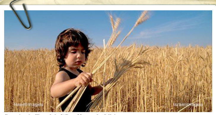
Preparing the First of the Wheat Harvest for Offering

Have you ever wondered whether the world will ever straighten its ways and live for the Lord? Continued on Page 4