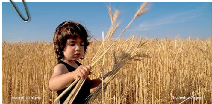
Preparing the First of the Wheat Harvest for Offering