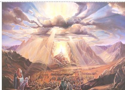
The Giving of the Torah