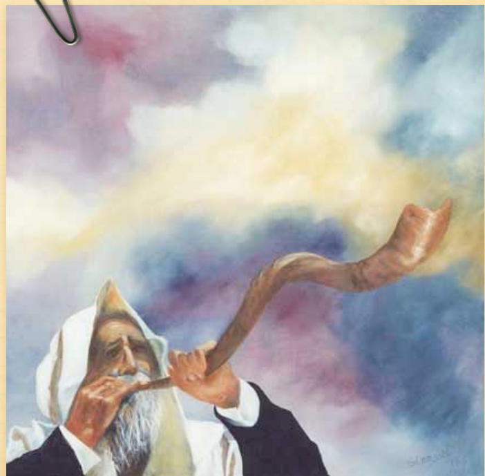
Blowing of the ram's horn or “shofar”

The primary items of the Feast of Trumpets are the blowing of a warning call on the shofar, a gathering of believers and an attitude of readiness to anticipate and prepare for the coming of the Day of the Lord.